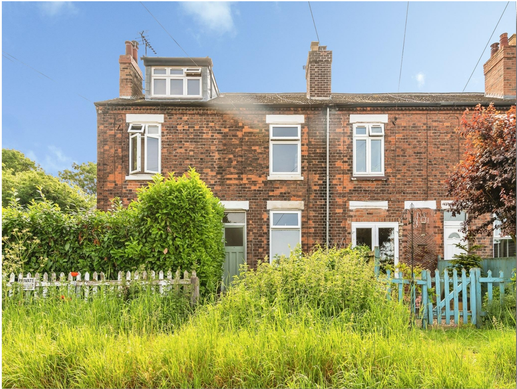
Top Row Stoke Lane, Burton Joyce Nottingham NG14 5HQ