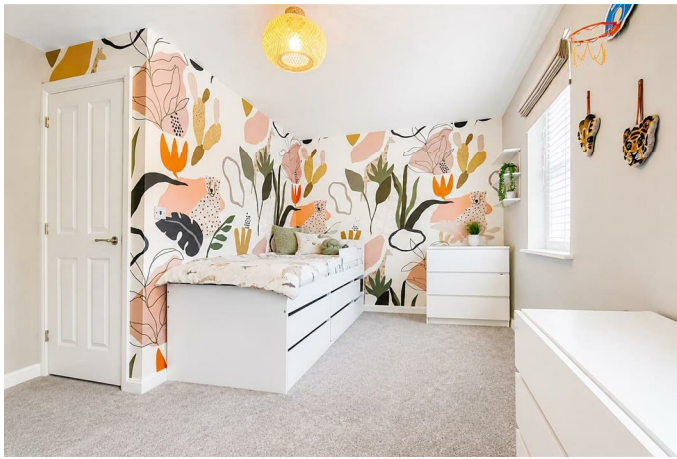
Bedroom Two 15'3 x 11'10 (4.65m x 3.61m)