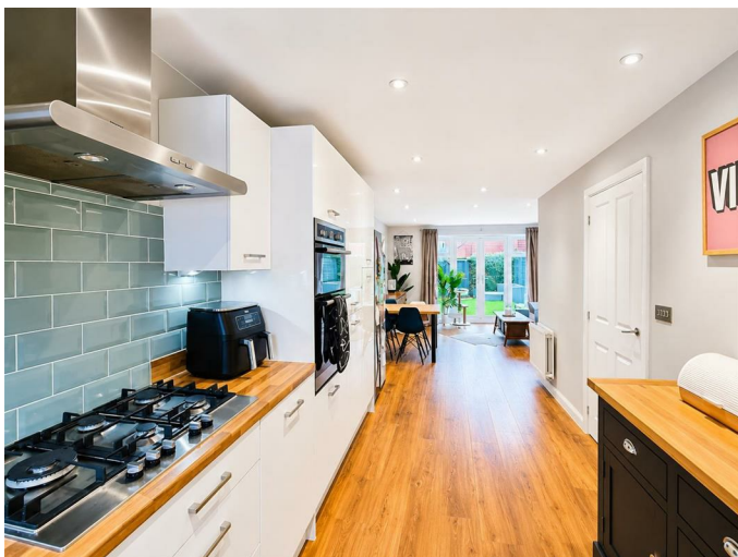
Kitchen/Dining/Family Room 31'10 x 15'3 (9.70m x 4.65m)