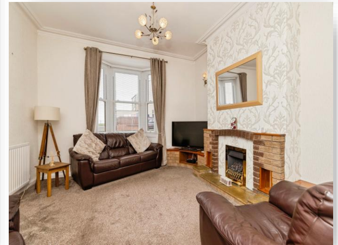
Montague Street, Hartlepool TS24 0NG