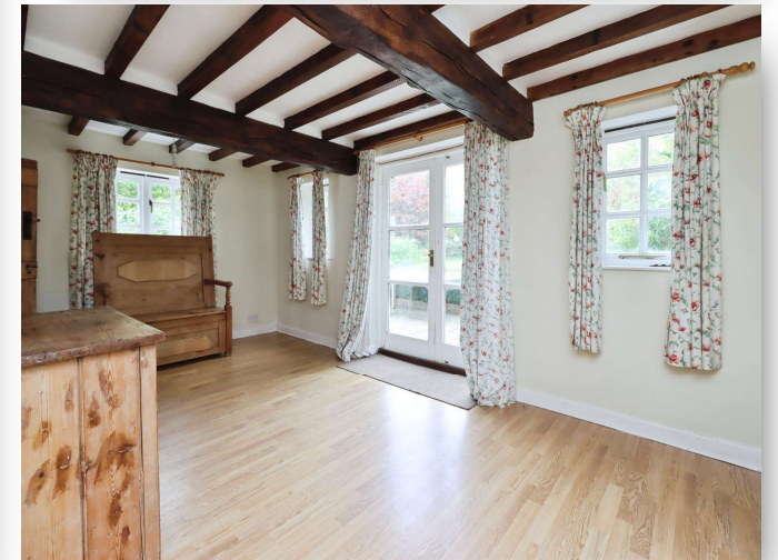
Laburnum Cottage Sarn, Sarn Malpas SY14 7LN