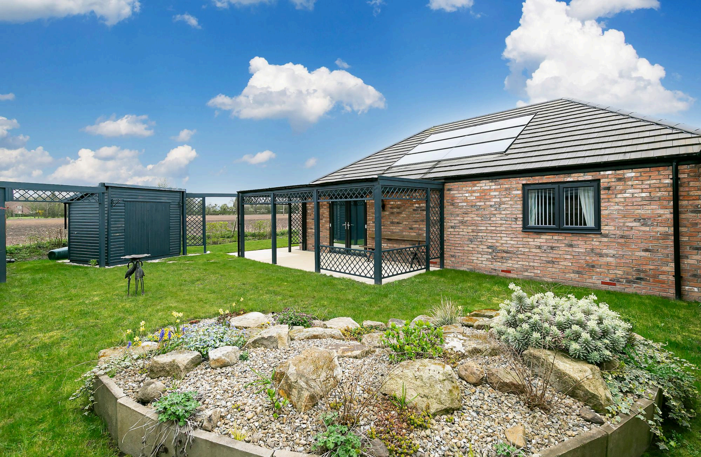
A SPACIOUS BUNGALOW WITH NO ONWARD CHAIN