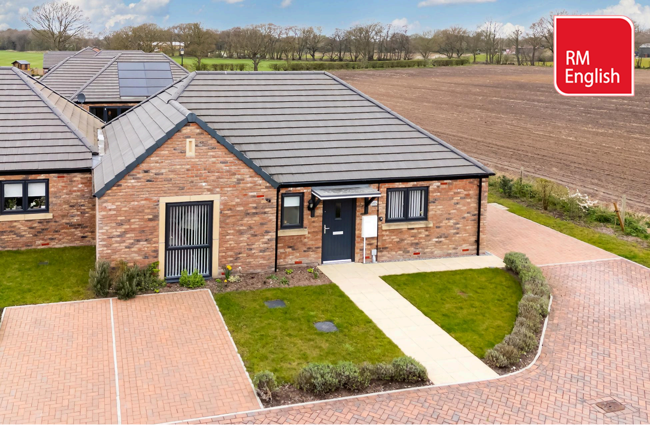
Lavender Fields, Barmby Moor, York, YO42 4AF