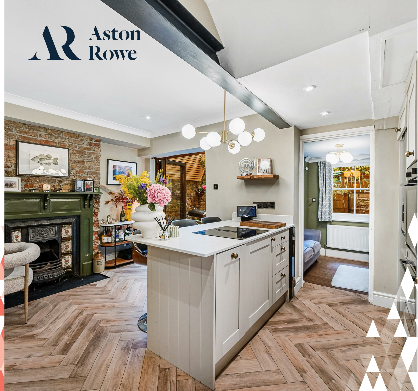
Spencer Road Approximate Gross Internal Area = 53.7 sq m / 578 sq ft