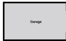
Ground Floor Area: 89.9 m 2 ... 968 ft 2