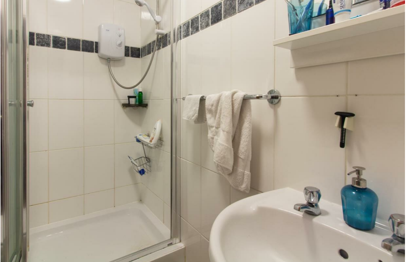
Glynrhondda Street, Cathays