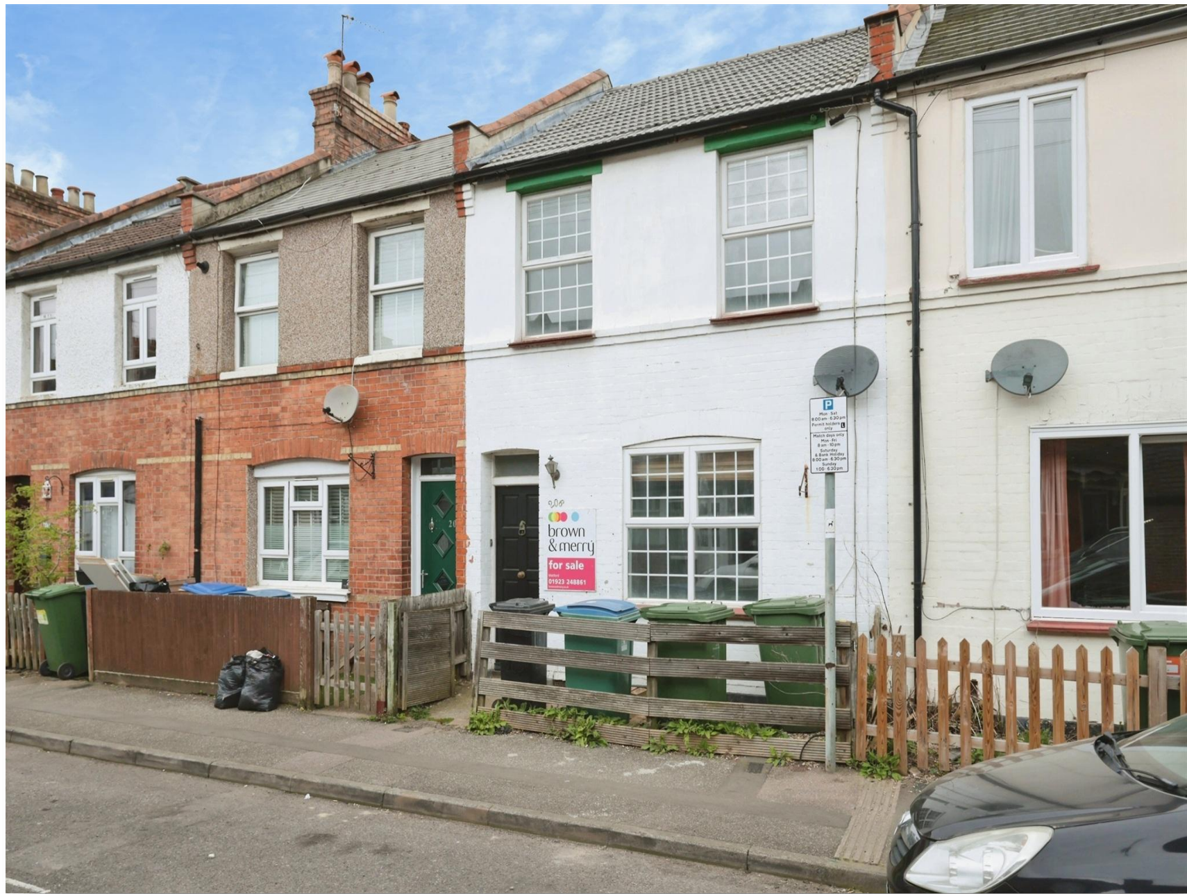
Chester Road, Watford, WD18 0LJ