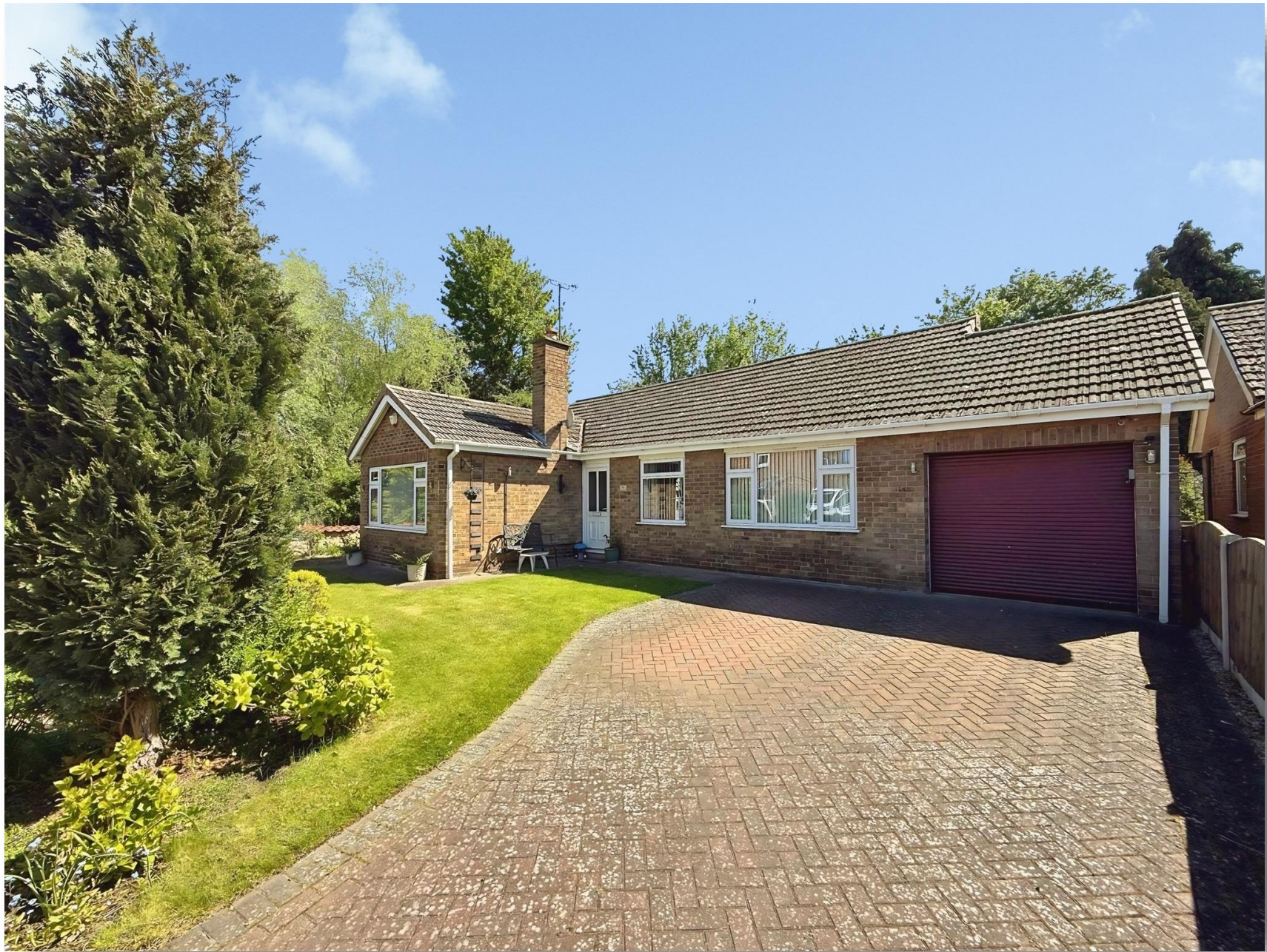
Castle Hill, Welbourn Lincoln LN5 0NF