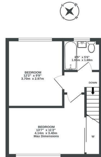
1ST FLOOR 388 sq. ft. (35.4 sq. m.) approx.

Illustrations are for reference purposes only, measurements are approximate, not to scale.