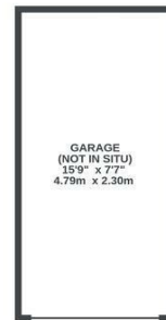
GARAGE (NOT INC IN TOTAL SQM) 0 sq. ft. (0.0 sq. m.) approx.