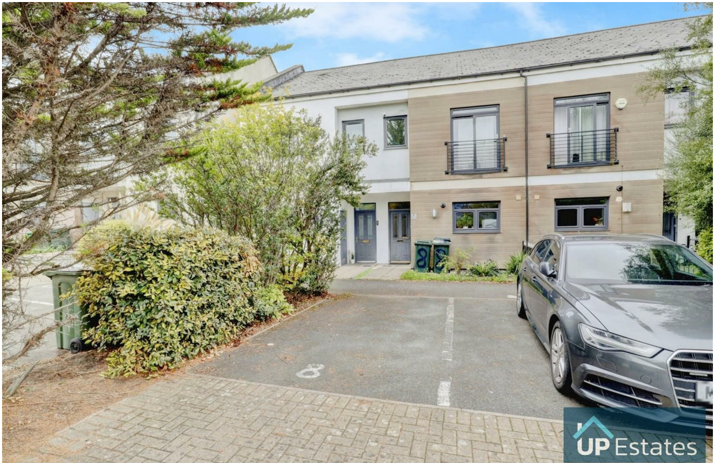
Paladine Way, Coventry