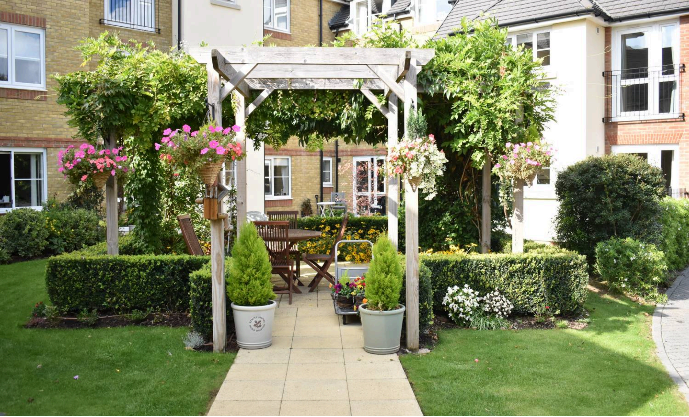
Emmeline Lodge, Kingston Avenue Leatherhead