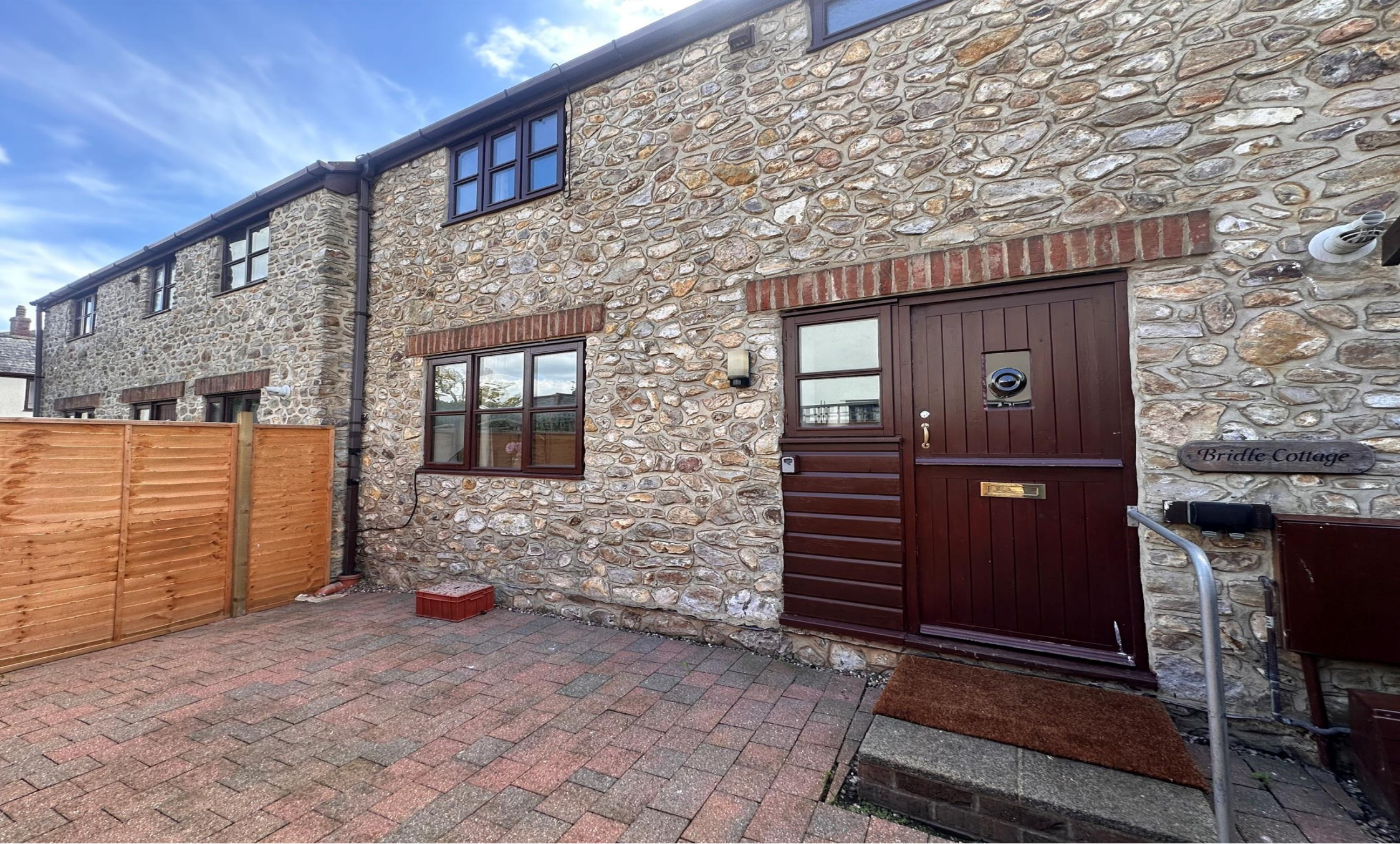
Bridle Cottage, Bath Street, Chard TA20 2ET