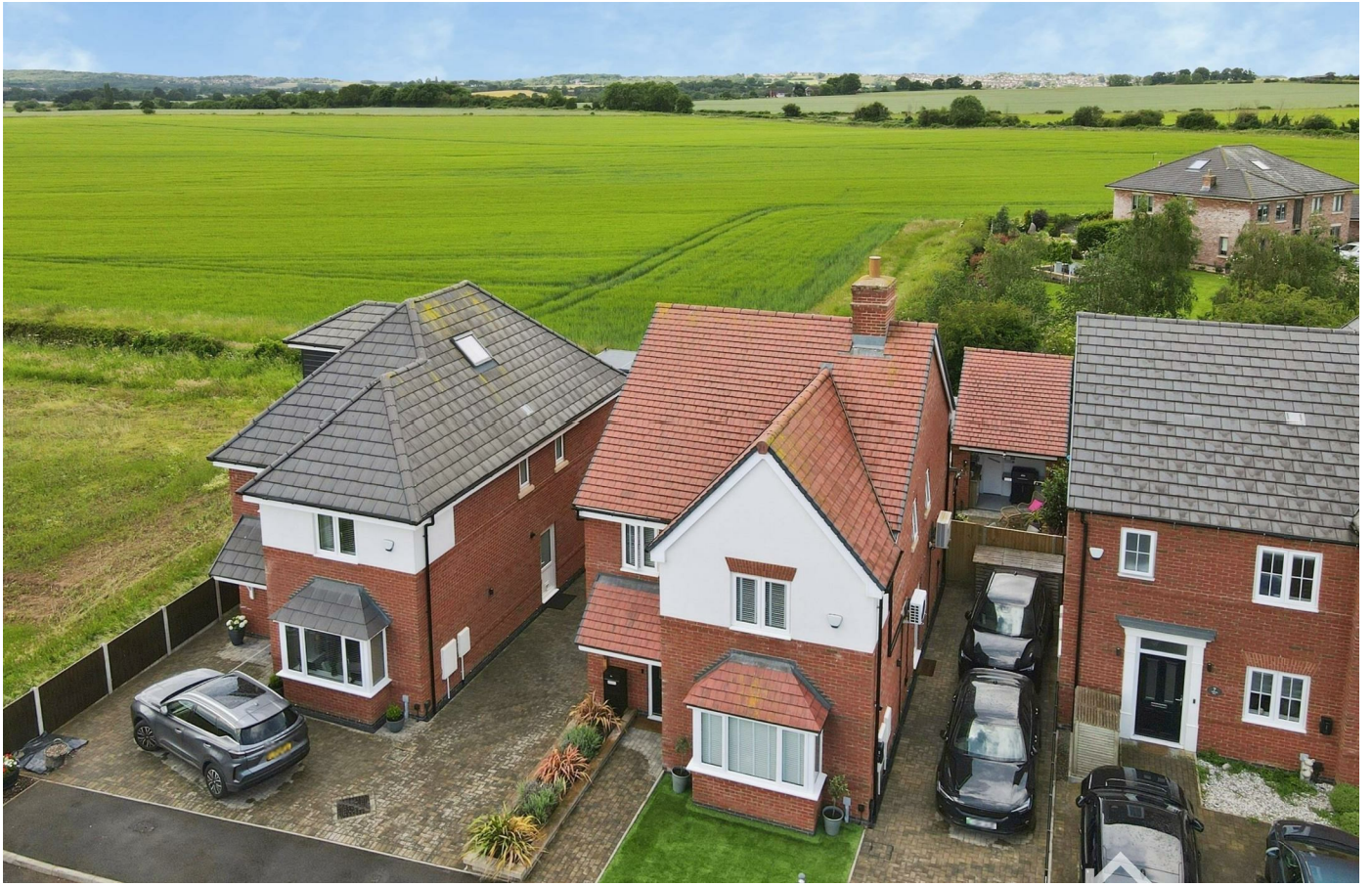
Warton Mill, Warton