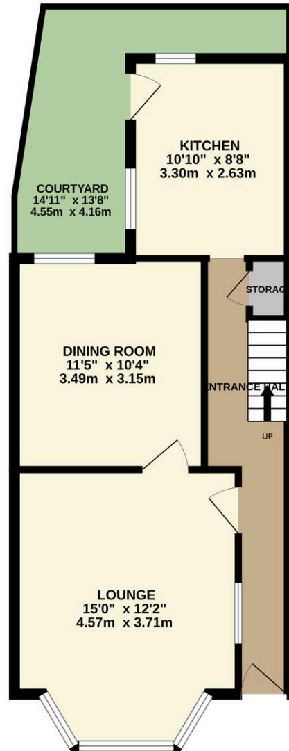
GROUND FLOOR 467 sq.ft. (43.4 sq.m.) approx.