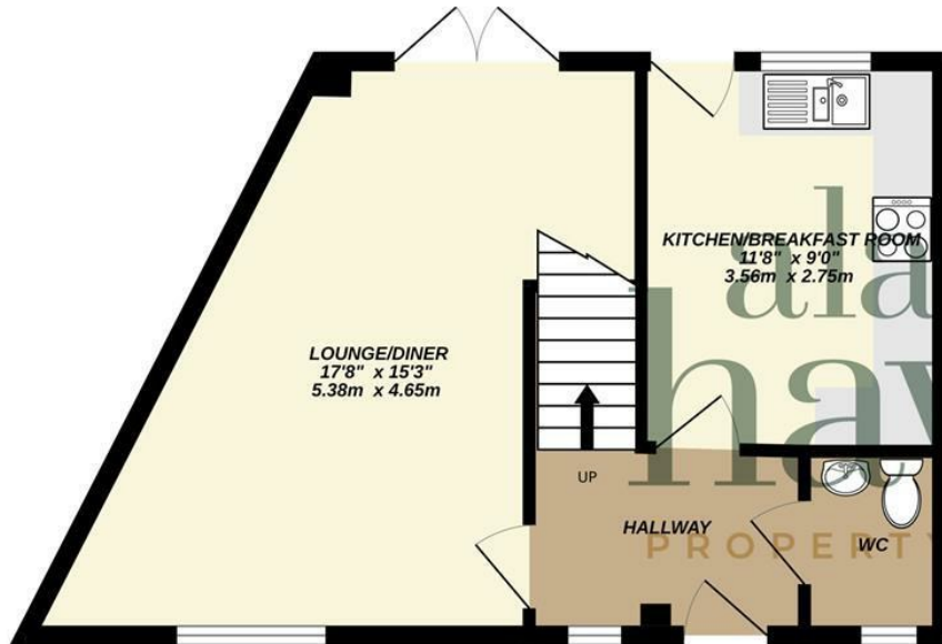
GROUND FLOOR 401 sq.ft. (37.3 sq.m.) approx.