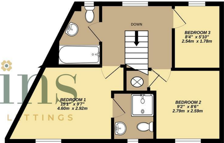
1ST FLOOR 401 sq.ft. (37.3 sq.m.) approx.