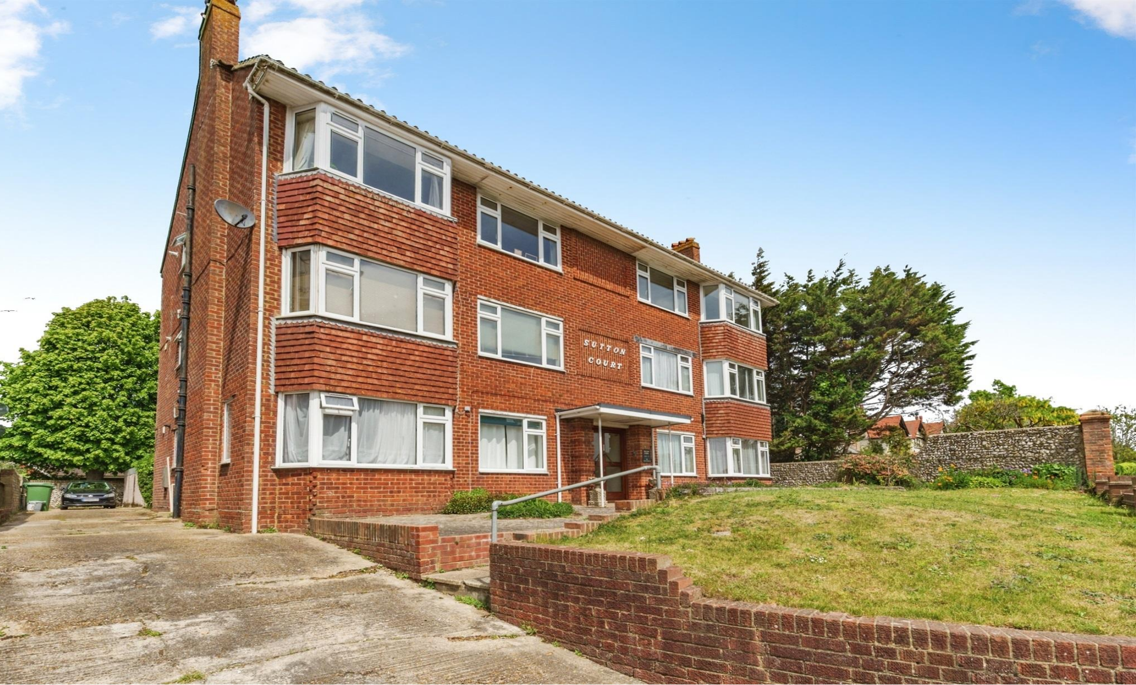
Sutton Court Sutton Park Road, Seaford BN25 1SJ