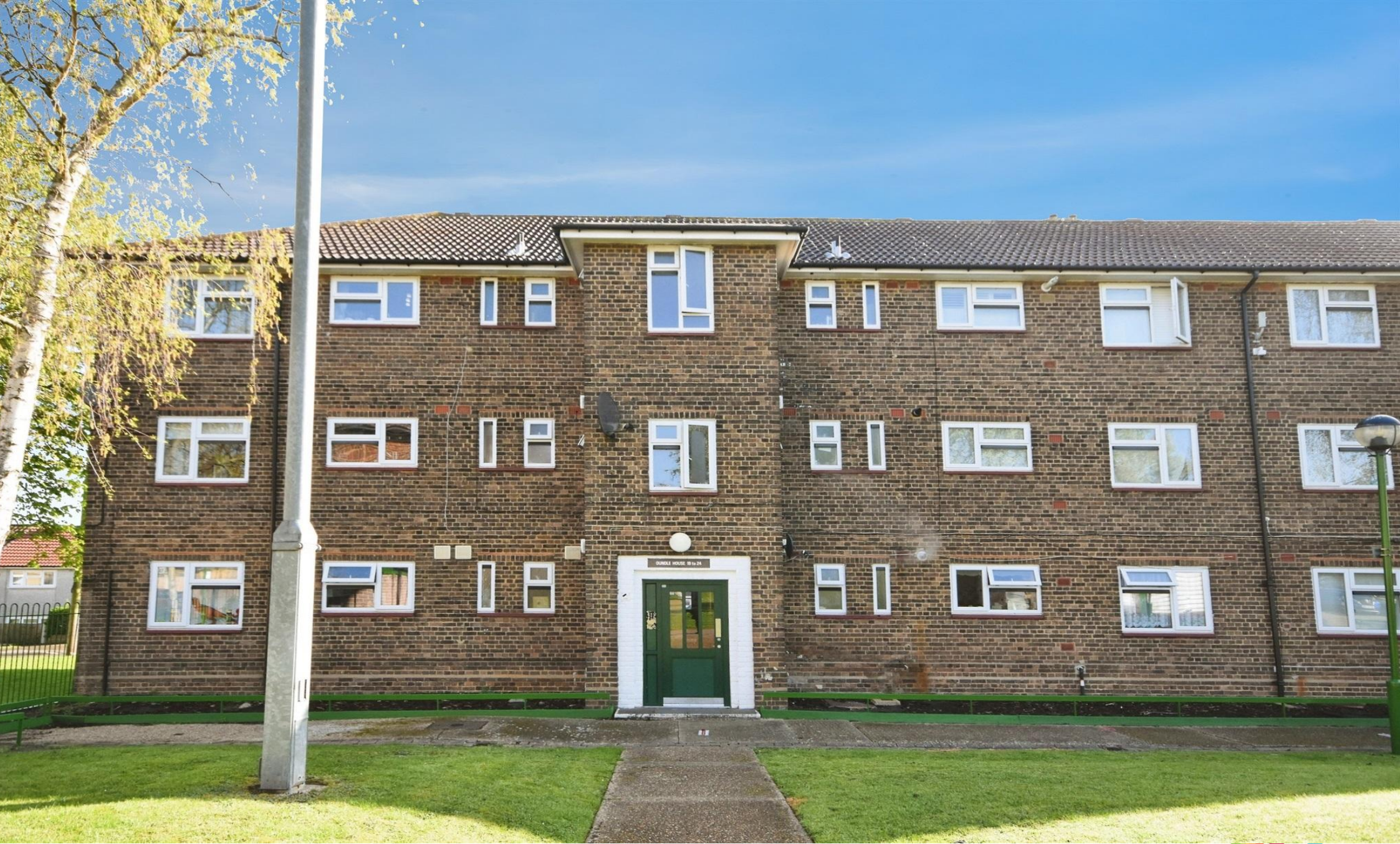
Oundle House, Montgomery Crescent, Romford, RM3 7XA