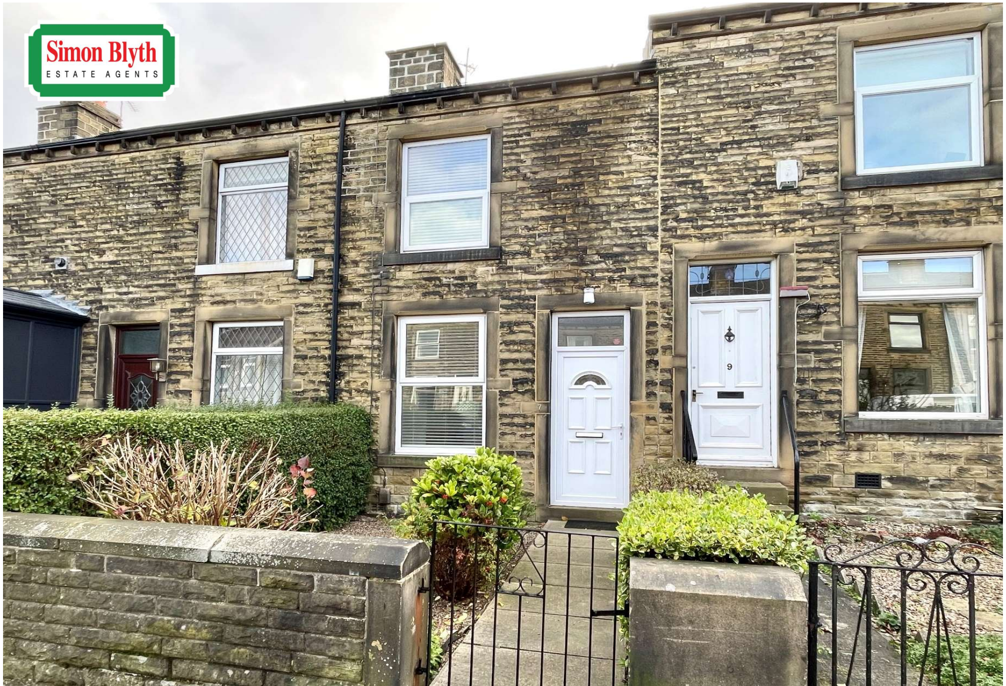
7 CADOGAN AVENUE, LINDLEY, HUDDERSFIELD