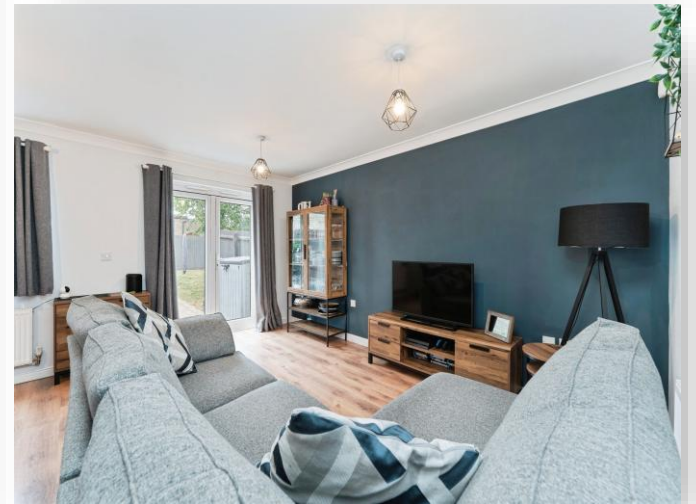
Guernsey Way, Littleport CB6 1GD