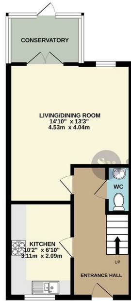
GROUND FLOOR 373 sq.ft. (34.6 sq.m.) approx.