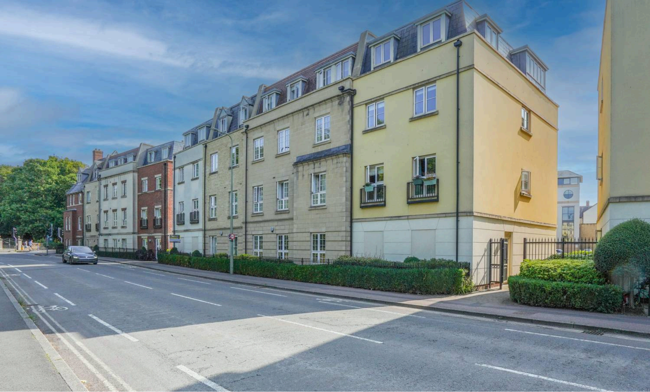
Flat F, 45 Woodford Way, Witney