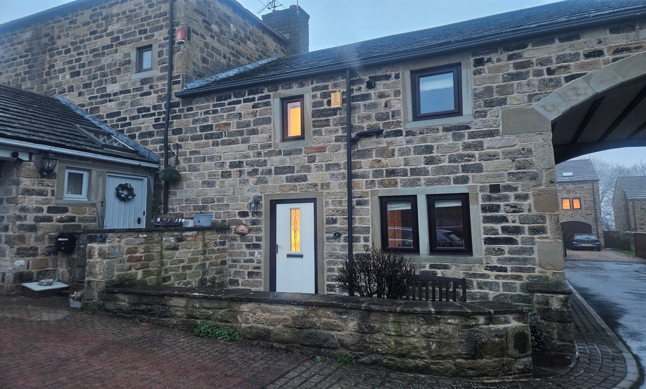
Old Mount Farm, Woolley Wakefield WF4 2LD