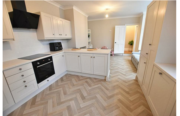
LIVING KITCHEN DINER