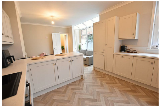
LIVING KITCHEN DINER