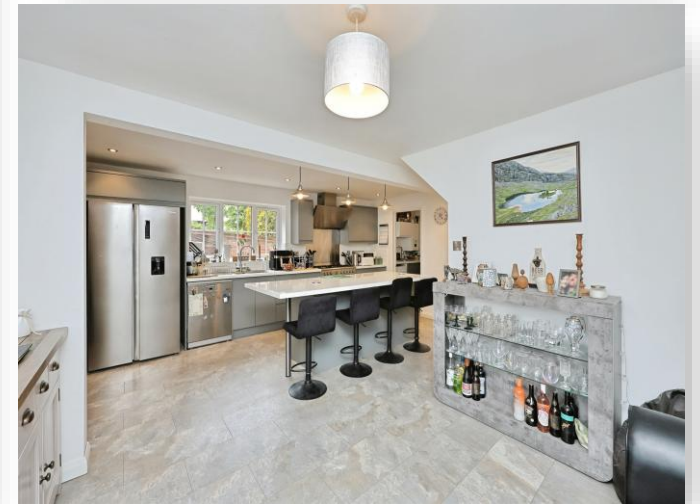
The Street, Poringland, Norwich, NR14 7JT