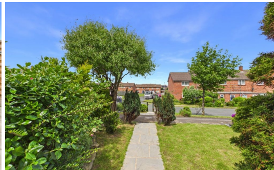
9 LILLA CLOSE, WHITBY- 2 bed Terraced House -£209,950