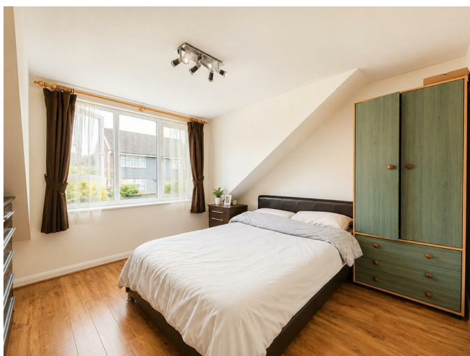
Bedroom Five 10'9 x 10'7 (3.28m x 3.23m)