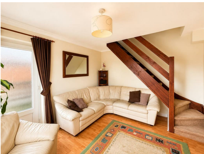
Reception Three 12'3 x 10'8 (3.73m x 3.25m)