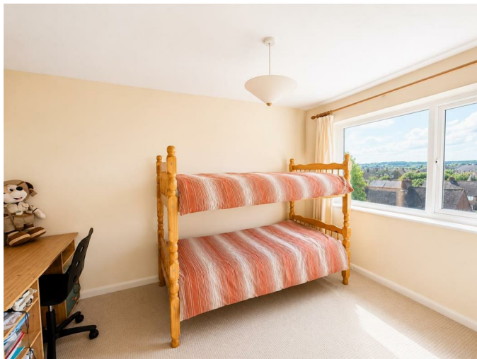
Bedroom Four 9'8 x 8'8 (2.95m x 2.64m)