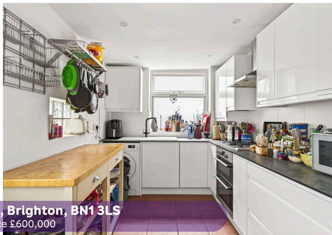
Guildford Street, Brighton, BN1 3LS Asking Price £600,000