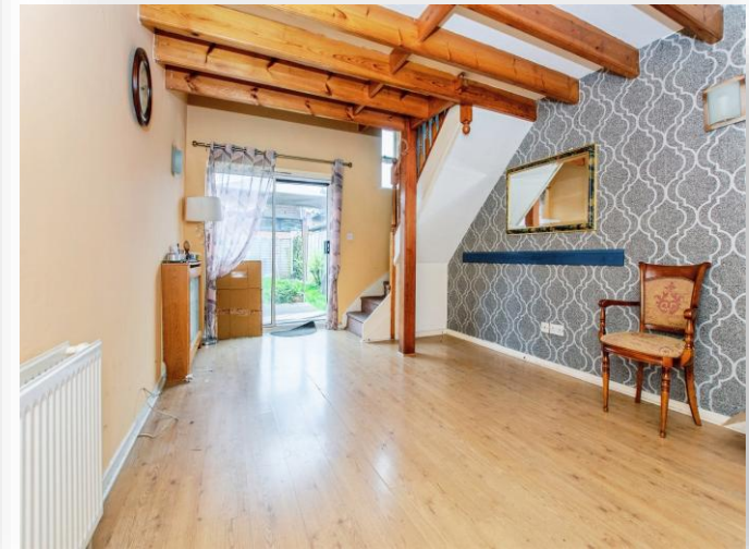
Heron Road, Wisbech, PE13 2TR