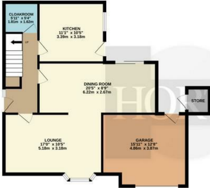
GROUND FLOOR 786 sq.ft. (73.0 sq.m.) approx.