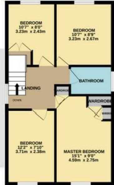
1ST FLOOR 514 sq.ft. (47.7 sq.m.) approx.