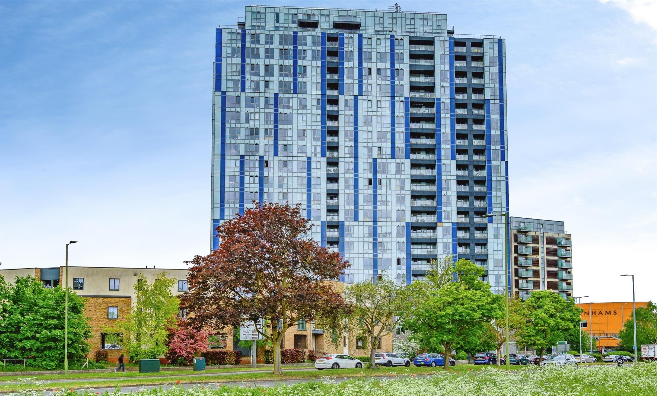
Kd Tower Cotterells, Hemel Hempstead HP1 1AT