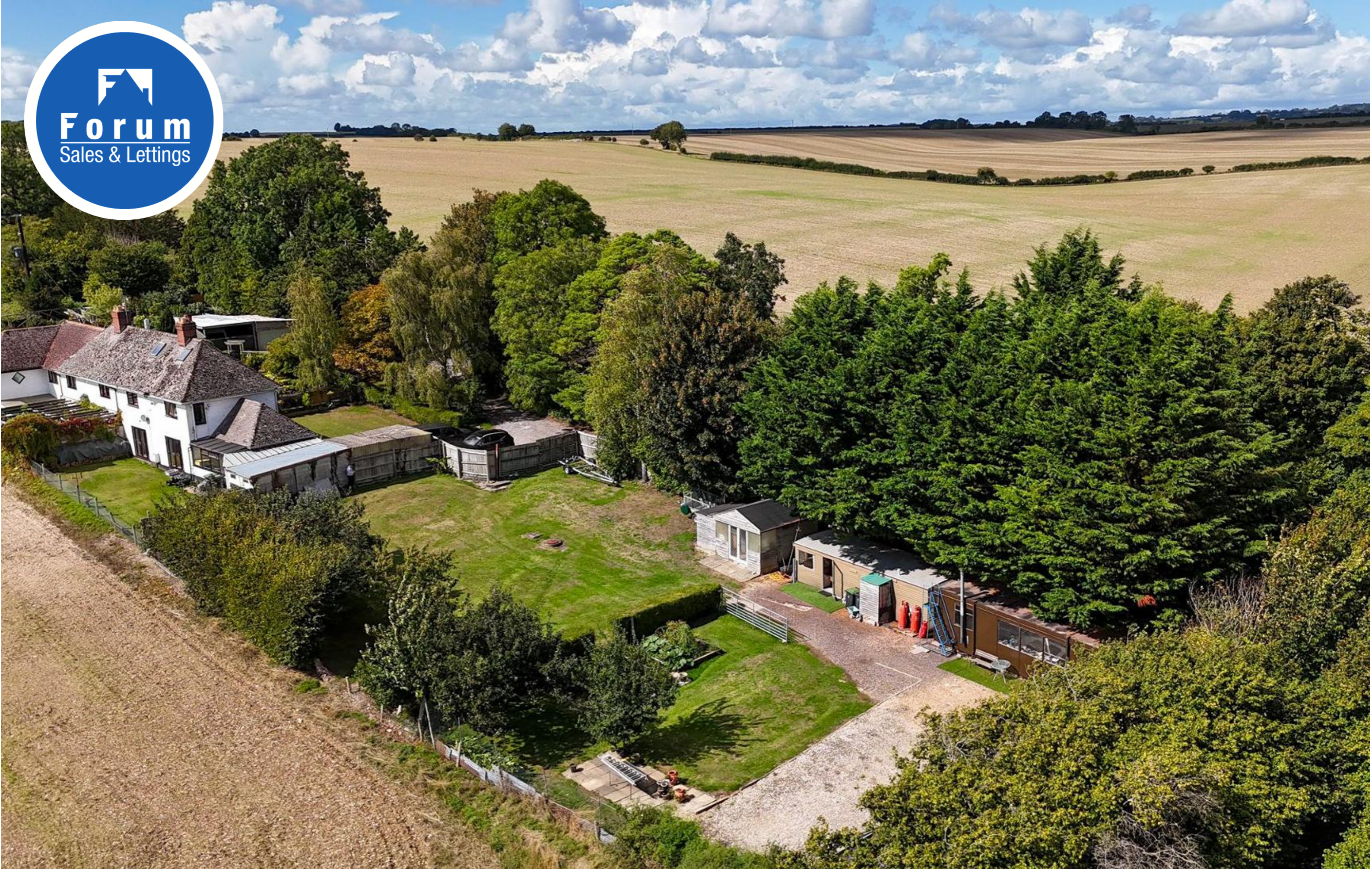
1 Longmead Cottages, Milborne St Andrew, Dorset, DT11 0HU