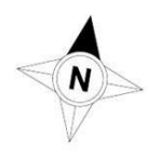
Stackpool Road, Bristol, BS3

We have carefully prepared these particulars to provide you with a fair and reliable description of the property. However, these details and anything we've said about the property, are not part of an offer of contract, and we can't guarantee their accuracy. All measurements given are approximate and our floorplans are provided as a general guide to room layout and design. Items shown in photographs are NOT included in the sale unless specifically mentioned, however they may be available by separate negotiation. We haven't tested any of the services, appliances, equipment, fixtures or fittings listed, or asked for warranty or service certificates, so unless stated they are offered on an 'as seen' basis. We recommend you carry out your own independent checks to satisfy yourself as to their working order and condition, prior to exchange of contracts. Please also be aware that if services have been switched off/disconnected/drailed down, reconnection charges may apply. If you wish to express an interest in this property or make a formal offer, you need to come through us for all negotiations. Intending purchasers will be asked to provide proof of their ability to fund the purchase and identification to comply with money laundering regulations and we ask for your co-operation in order to avoid delay in agreeing the sale.