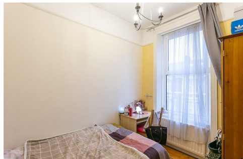
GROUND FLOOR 16.94m 2 (182.7 sq.ft) approx.

Available 8th July 2026 | £135pppw/ £1,755pcm | First Floor 'Tyneside' Flat | Three Double Bedrooms | 758 Sq. Ft (70.4m 2 ) | Well Presented | Furnished | Lounge | Kitchen | Bathroom WC | GCH & DG | Private Rear Yard | Great Location | Storage Space | Close To West Jesmond Metro Station | Council Tax Band: B | EPC Rating: E