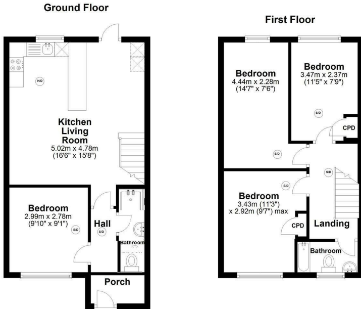
12 Fair Green Way, Selly Oak, Birmingham