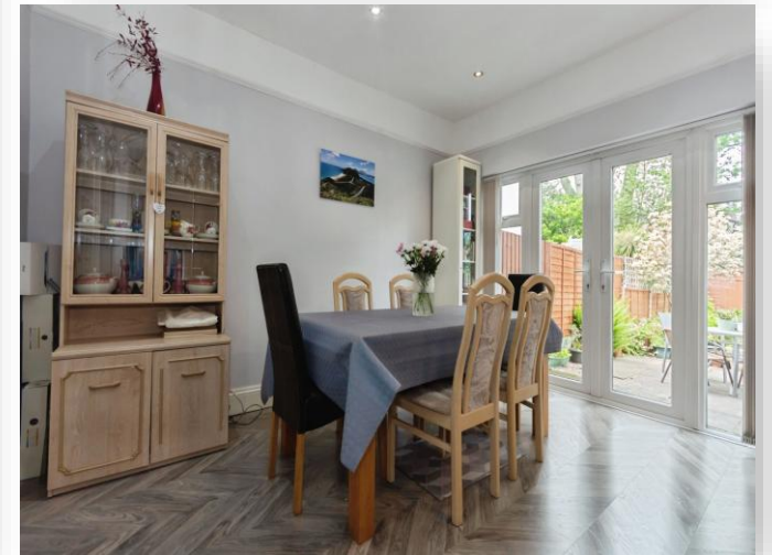
Whitley Court Road, Quinton Birmingham B32 1EZ