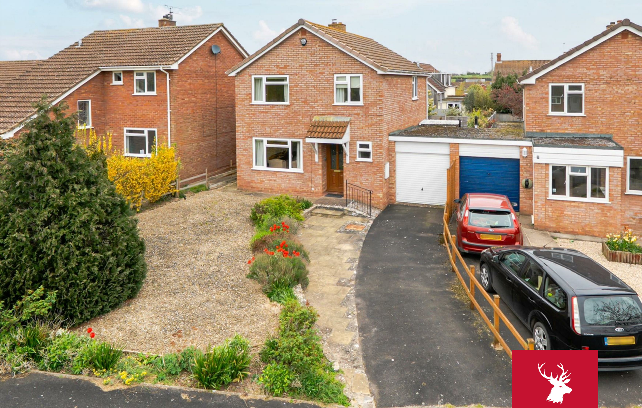
22 Huntham Close