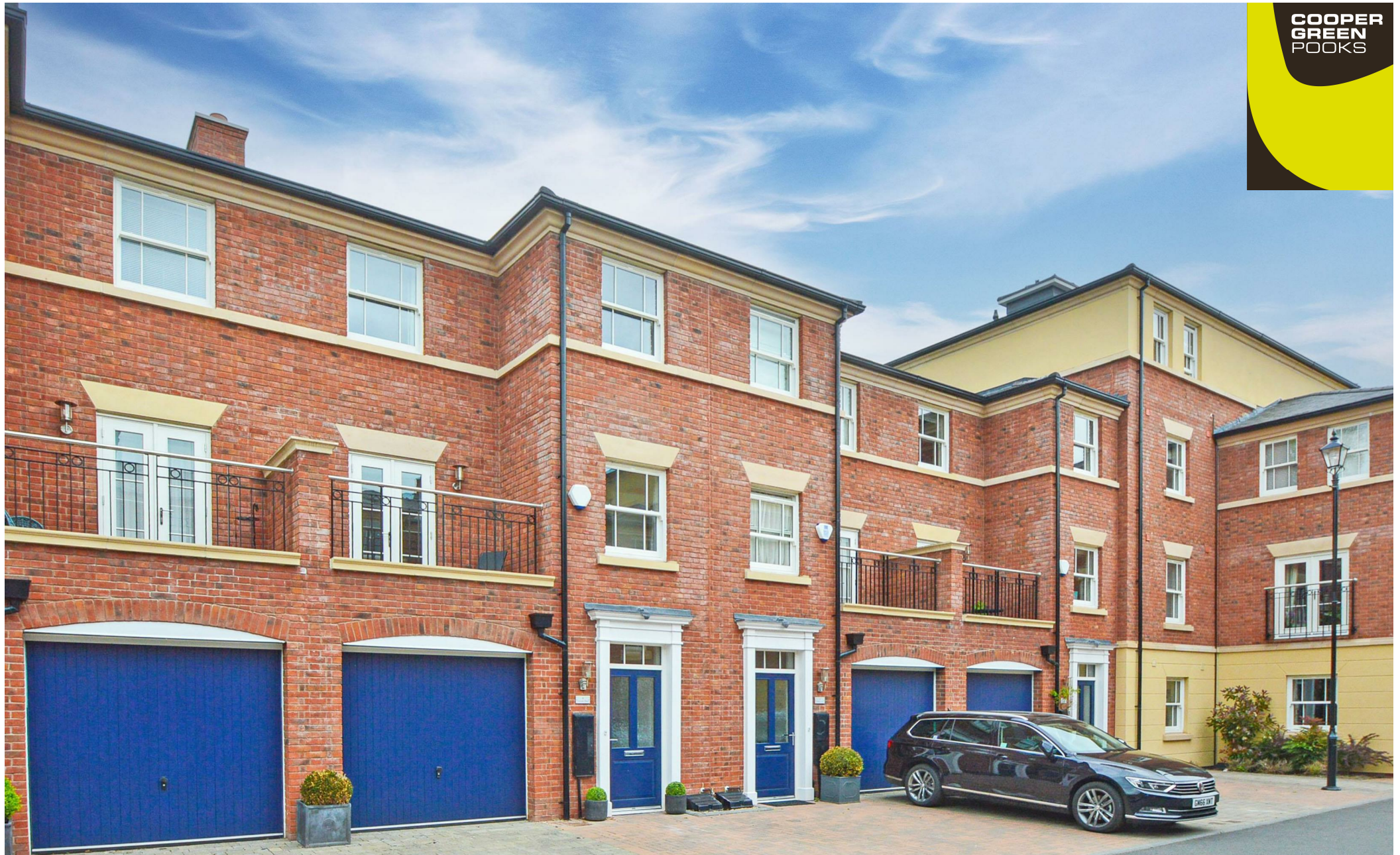
6, Cadman Place, The Old Meadow, Shrewsbury, SY2 6AN £1,750 Per Month