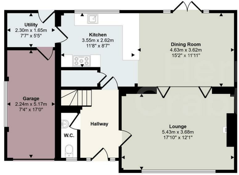
Ground Floor Approx 80 sq m / 861 sq ft

Approx Gross Internal Area 144 sq m / 1545 sq ft