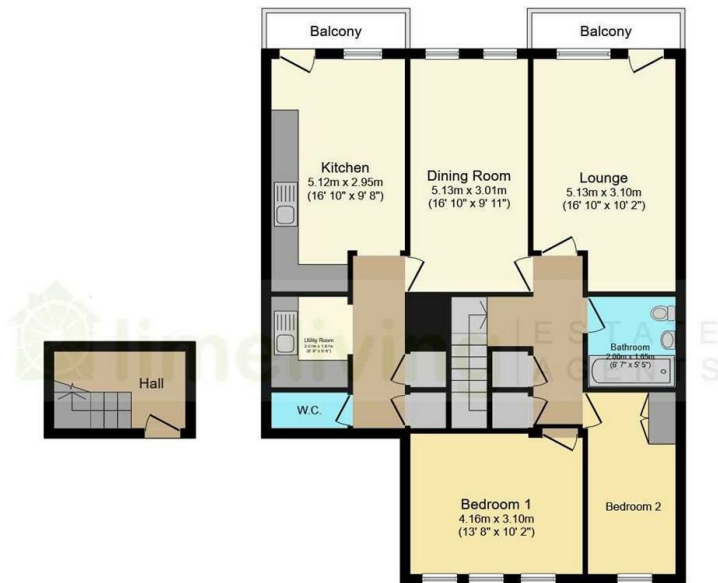
Ground Floor Floor area 4.9 m 2 (53 sq.ft.)