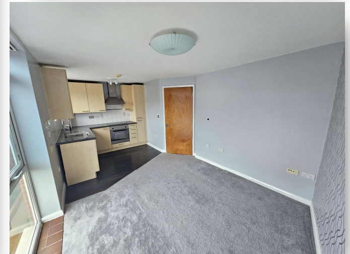
Kerr Place, Aylesbury HP21 7BB