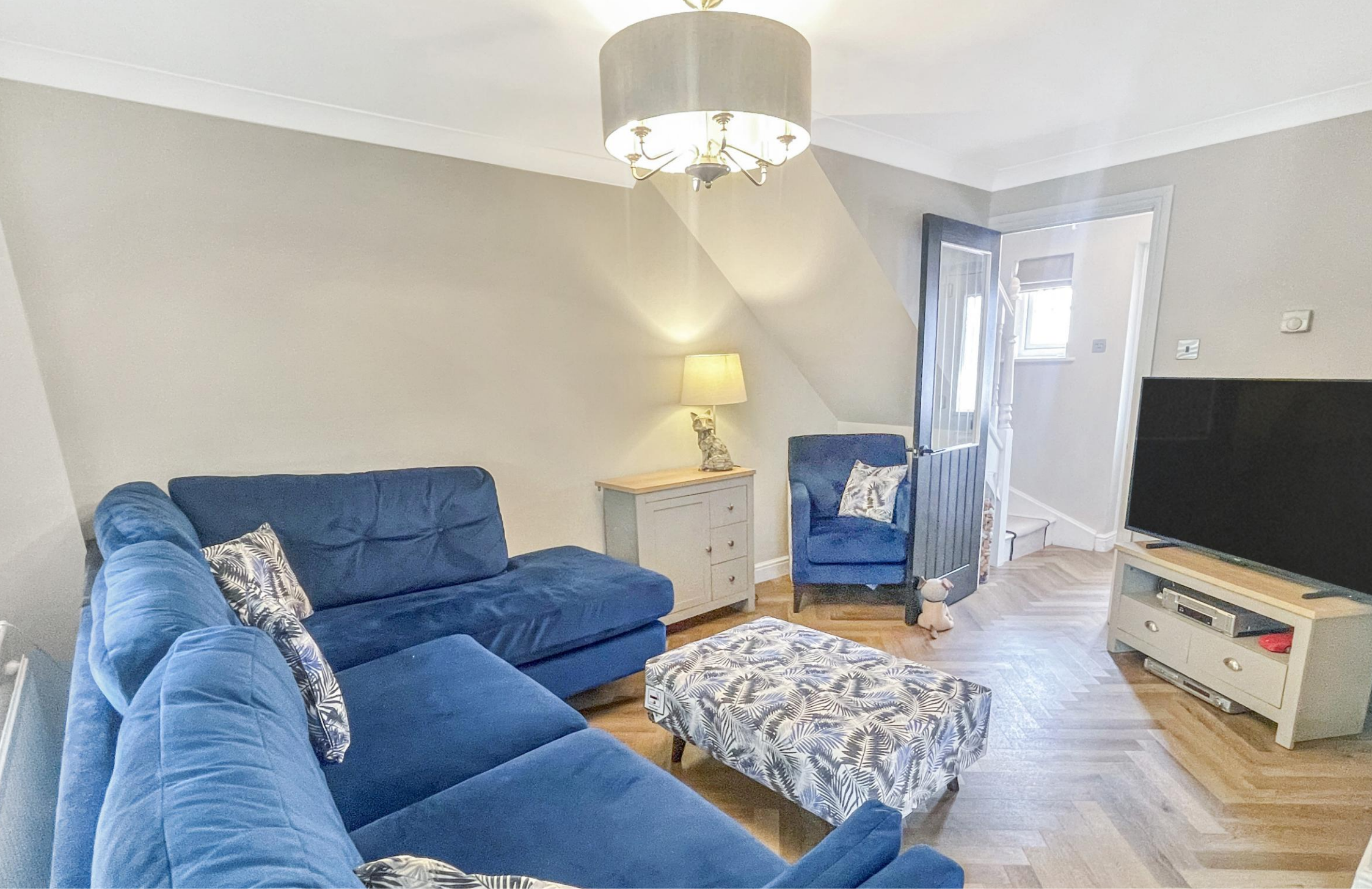
Warren Lingley Way, Tiptree, Colchester, CO5 0FE