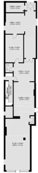
Ground Floor Total area (approx.): 170.0 sq. m (1,828.0 sq. ft)