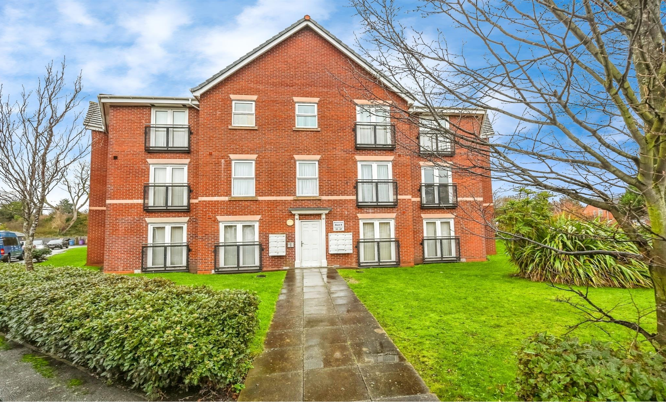
Mystery Close, Liverpool L15 0AB