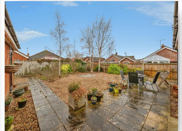
Long Barrow Drive, North Walsham NR28 9YA