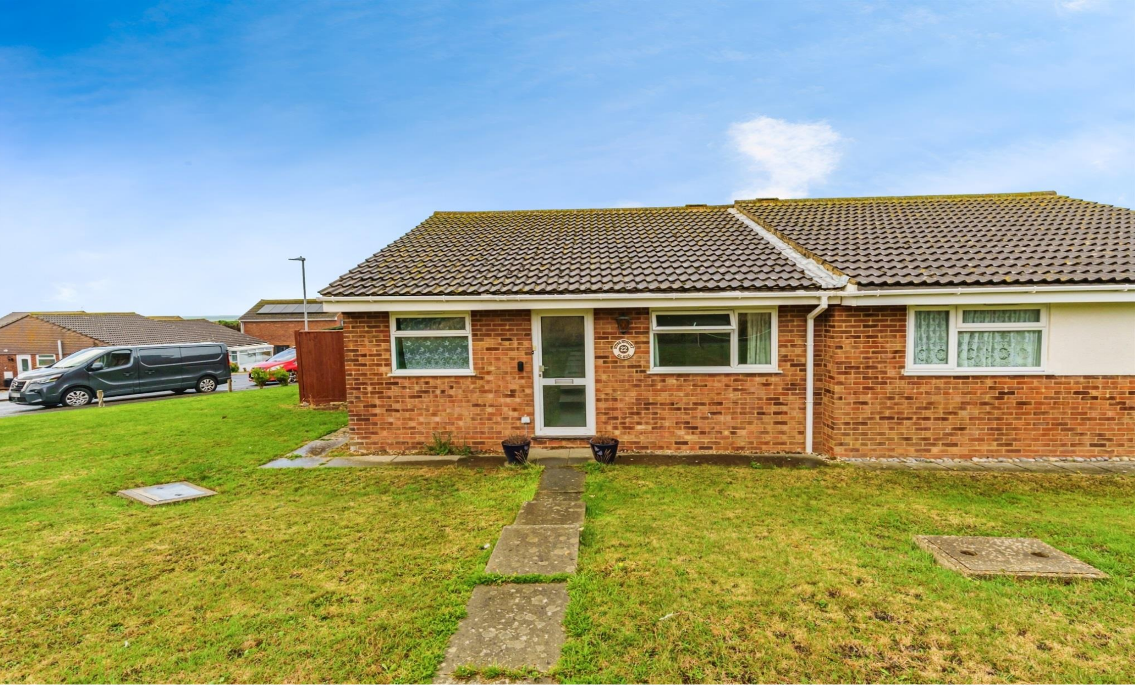
Rosemount Close, Seaford BN25 2TP