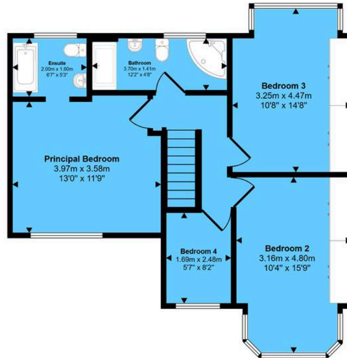
First Floor Approx 64 sq m / 688 sq ft