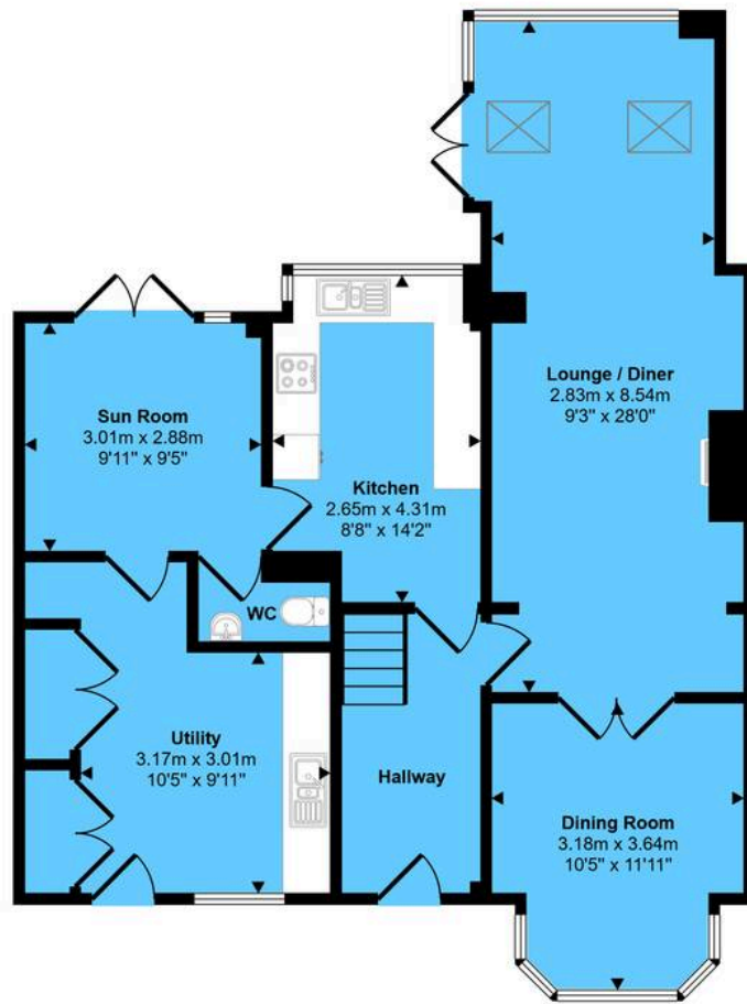
Ground Floor Approx 82 sq m / 884 sq ft

Approx Gross Internal Area 158 sq m / 1701 sq ft