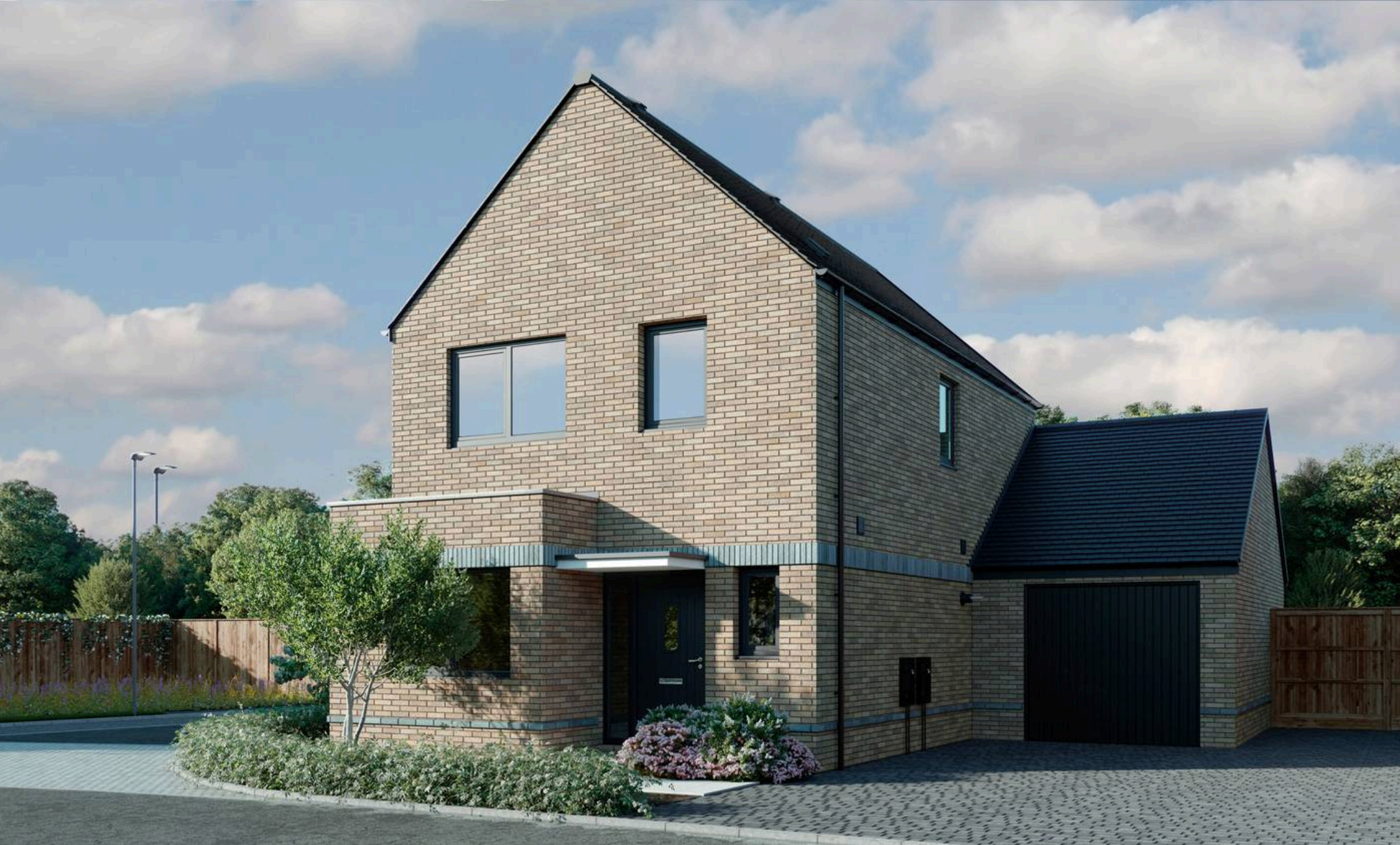
The Juniper I Amber Waterside, The Lakes. £575,000