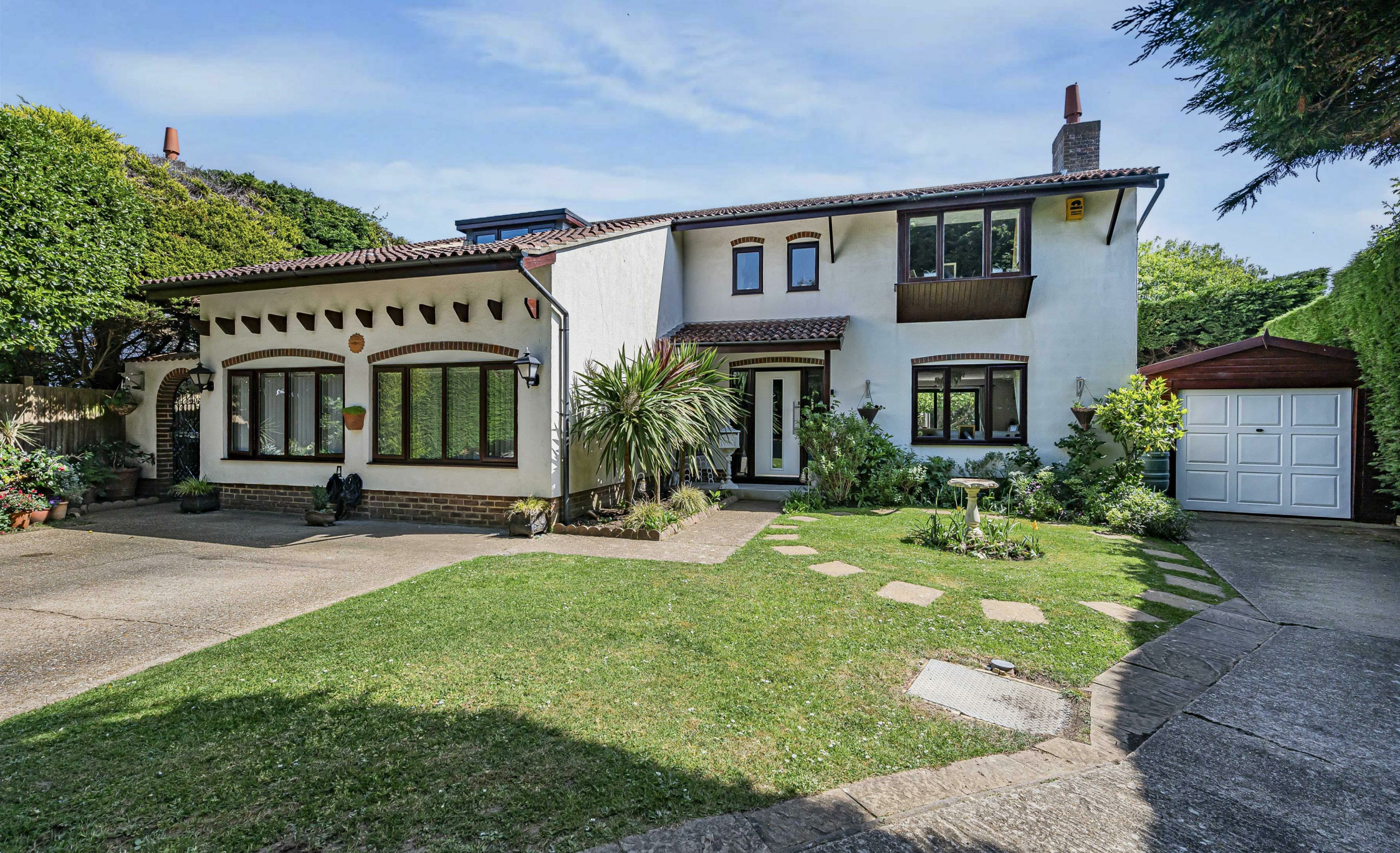
The Hideaway, Broadleaze Gardens Eastbourne Road, Seaford, BN25 4BE